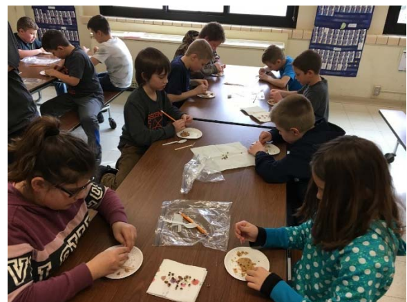
Students from Weidman Elementary

Math and Science - STEM Activities at Weidman Elementary - Our Science team visited Weidman Elementary in February and March to showcase STEM activities to the Weidman Science Alliance students. These students are part of an after-school club that meets twice a month and do various science-related activities. The MOISD has been invited for a second year to incorporate STEM into their club sessions. Students learned the importance of communication and asking questions when working with a team. They also learned how environmental engineers design processes to maximize the amount of minerals that are mined while maintaining a healthy environment. Students used hard and soft cookies to "mine" out chocolate chips while trying to keep the cookie intact.