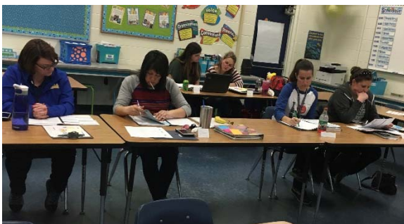
Morley teachers at work